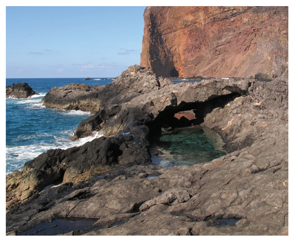
Figure 3. Parcel Pool, Trindade Island, Brazil, type locality of Pempheris gasparinii sp. n. (photo H.T. Pinheiro).