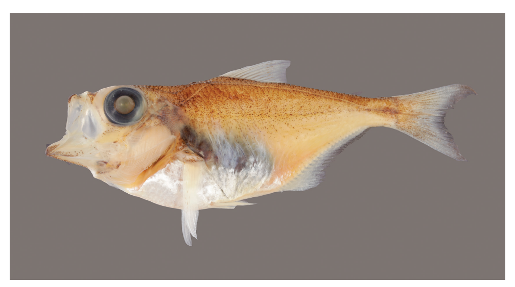
Figure 2. Pempheris gasparinii sp. n., preserved holotype, 64.5 mm SL, CIUFES 3127.